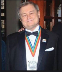
JD Doyle Founder JD Doyle Archives